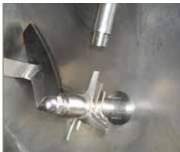
Liquid injectors and choppers