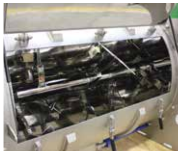
304L / 316L stainless steel chamber internally polished (externally on request)