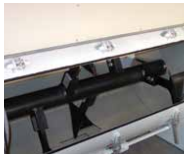
Tack-free liner, large inspection door and easy to clean interior