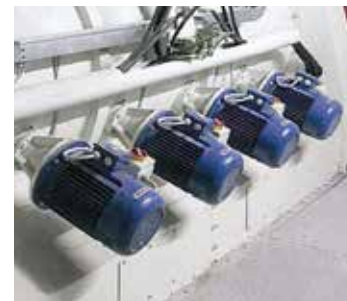
Choppers, liquid injectors and temperature jacket